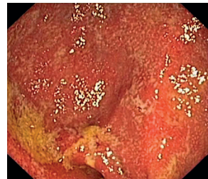
Fig 48. Pouchitis, endoscopic friability

NOTE. Pouchitis is defined as a total score of \geq 7 . Adapted and reprinted with permission