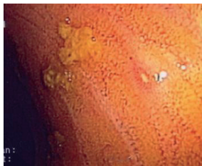
Fig 31. Crohn’s disease, Rutgeerts’ score grade 1 < 5 aphthous lesions