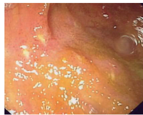
Fig 32. Crohn’s disease, Rutgeerts’ score grade 2 > 5 aphthous lesions