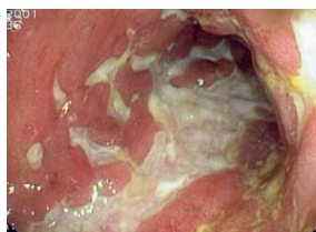
Fig 34. Crohn’s disease, Rutgeerts’ score grade 4 – Diffuse inflammation with large ulcers mm

Reference: Rutgeerts P, Geboes K, Vantrappen G, et al. Predictability of the postoperative course of Crohn’s disease. Gastroenterology . 1990;99:956–63.