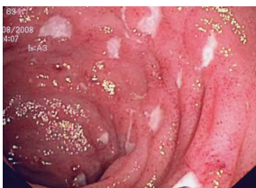
Fig 33. Crohn’s disease, Rutgeerts’ score grade 3 – Diffuse aphthous ileitis